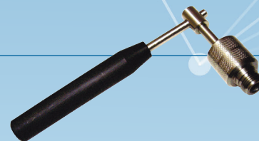
Model RC 4250 (external threads) For use with Calgaz 2AL, Calgaz 8AL Calgaz 6D and Calgaz 10AL cylinders