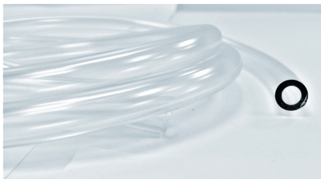
TU 1596 - PVC Tubing